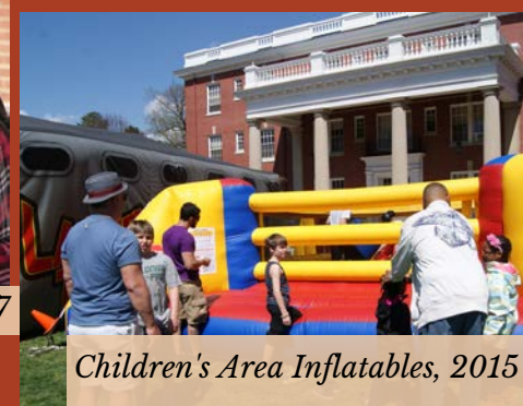
Children's Area Inflatables, 2015