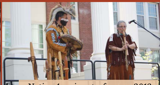
Native American performers, 2012