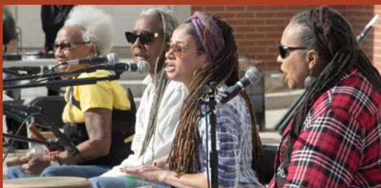
Gaye Adegbolola & The Wild Rutz, 2017