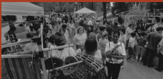
Vendors on campus walk, 1999

Here is a selection of images from the Fair through the years: