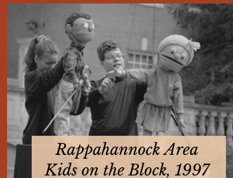
Rappahannock Area Kids on the Block, 1997