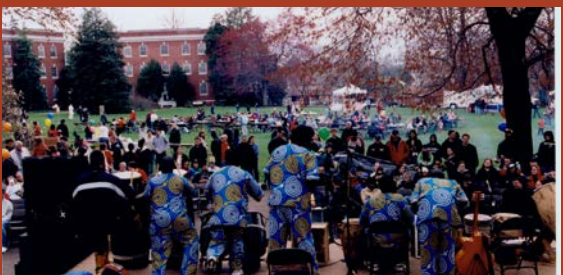
African Performers, 2004