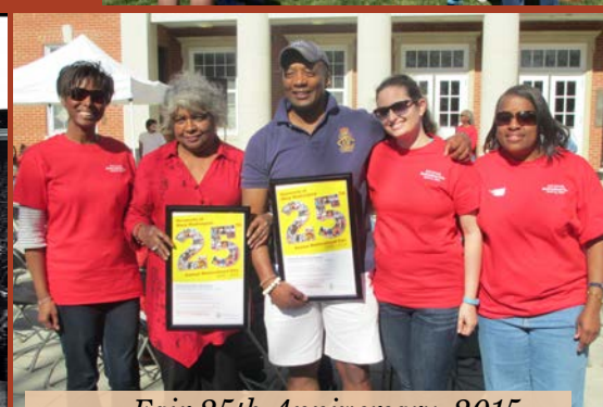
Fair 25th Anniversary, 2015