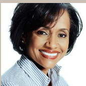
Judge Glenda Hatchett

This year's Dr. Martin Luther King Jr. keynote speaker is Ernest Green, one of the Little Rock Nine who was the first African-American graduate of Little Rock Central High School. He and the other members of the Little Rock Nine were awarded the Congressional Gold Medal in 1999 in recognition of their bravery during integration at the high school.