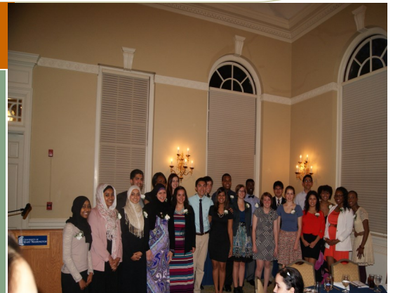
2013 Senior Recognition Program Honorees

If you would like to be added to the JFMC Alumni Database, please email your name, phone number, email address, mailing address and graduation year to umwjfmc@gmail.com .